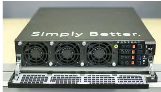
FIGURE 1 Controller with the front bezel open